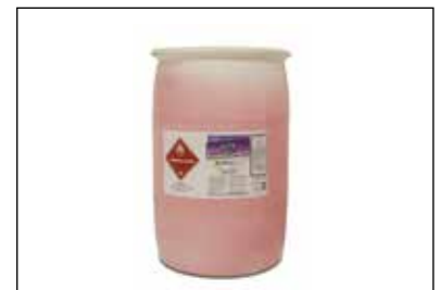
Elite™ Premium Glass and Multi-Surface Cleaner Concentrate 10:1