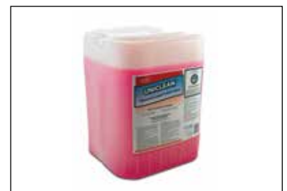
Uniclean ™ Neutral pH Vehicle Wash