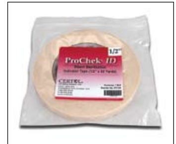
ProChek® ID Indicator Tape