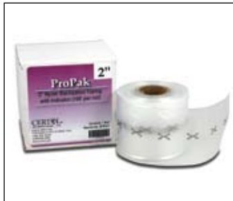
ProPak™ Nylon Sterilization Tubing