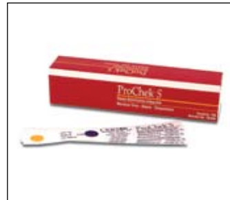
ProChek® S Steam Sterilization Integrator