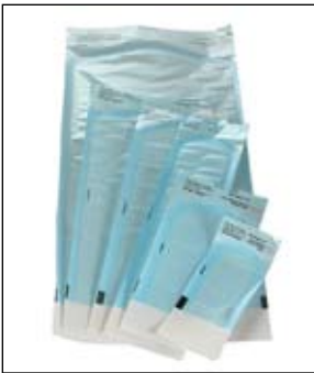
ProView® plus Self Sealing Sterilization Pouches

Other products available from Certol include: