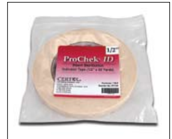
ProChek® ID Indicator Tape