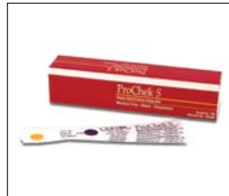
ProChek® S Steam Sterilization Integrator