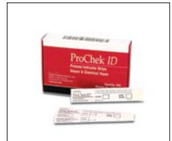
ProChek® ID Indicator Strips for Steam and Chemical Vapor