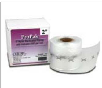
ProPak™ Nylon Sterilization Tubing

Other products available from Certol include: