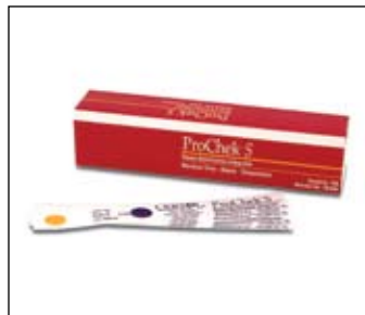
ProChek® S Steam Sterilization Integrator