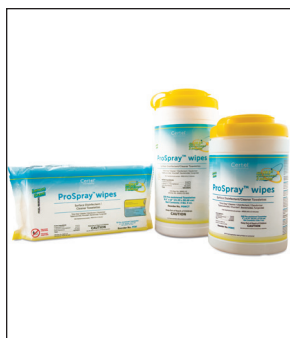
ProSpray™ wipes Surface Disinfectant/ Cleaner Towelettes