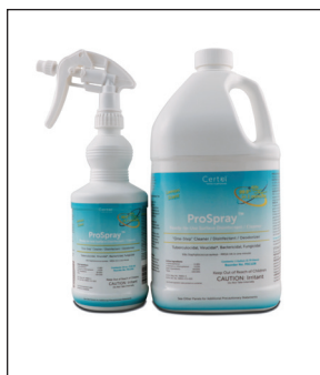
ProSpray™ Ready-to-Use Surface Disinfectant/Cleaner

Other products available from Certol include: