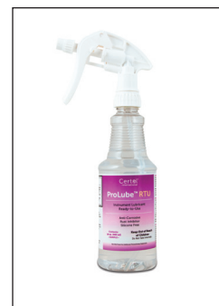
ProLube™ RTU Instrument Lubricant Ready-to-Use