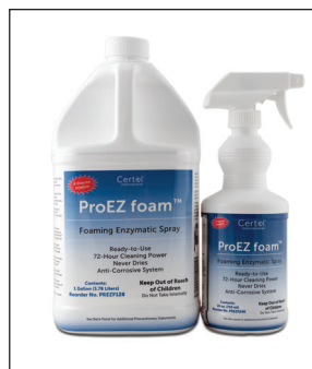
ProEZ foam™ Ready-to-Use Foaming Enzymatic Spray