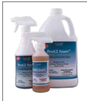
ProEZ foam™ Ready-to-Use Foaming Enzymatic Spray