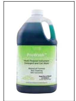
ProWash™ Multi-Purpose Instrument Detergent and Cart Wash