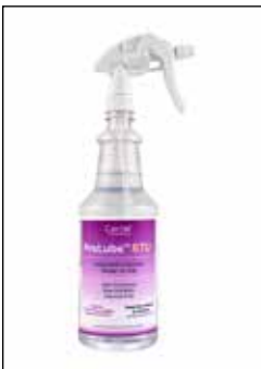
ProLube RTU™ Instrument Lubricant Ready-to-Use

Other products available from Certol include: