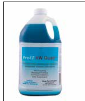
ProEZ AW Quad™ Quadruple Enzyme Automatic Washer Detergent