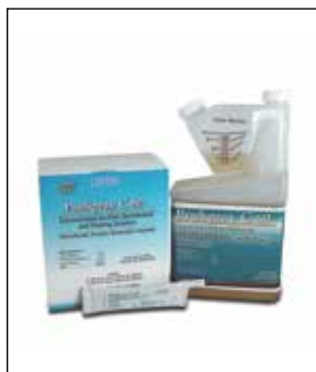
ProSpray C-60™ Concentrated Surface Disinfectant/Cleaner

Other products available from Certol include: