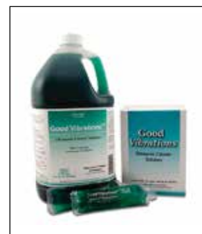
Good Vibrations™ Ultrasonic Cleaner Solution